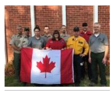
A Canadian Incident Management Team with two BCWS personnel was deployed to Australia in 2020 (January 31, 2020).

covered bν the iurisdiction that requested the resources. In addition to this, any incoming firefighting crews are trained to CIFFC's national standards.