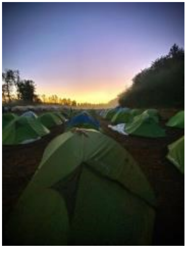
A B.C. fire camp set up in Oregon.

precautions were taken, including physical distancing and enhanced safety and sanitation protocols. Personnel were required to complete a 14-day quarantine upon their return to B.C.