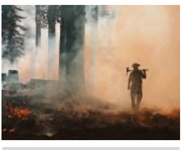
BCWS personnel working on the North Complex in California (Oct. 27, 2020).