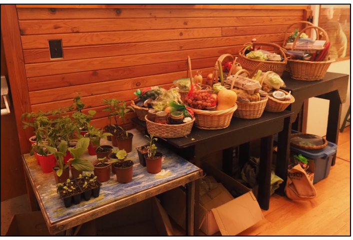
Baskets filled with Lasqueti bounty for the cultural workers