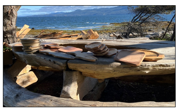
Plates made by Lasquetians for ancestral food offerings